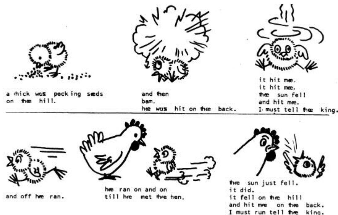
Fig 3. A Reader that combines features of the ITA and the Linguistic system to get idiomatic sentence patterns but only a few misspellings.

However, the teacher should be aware that some function words in English change their pronunciation when they are unstressed (e.g. a, the, of, you, just, can, etc.) There is probably little or no need to teach these pronunciation changes. Most children know them and will make them automatically.